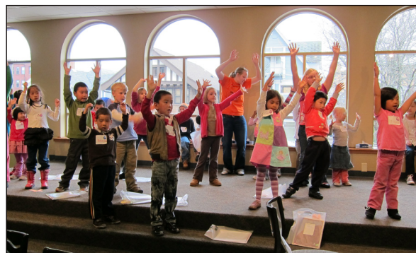
The children joyfully singing at Easter for Kids

The 7 "Saturday for Kids" events had an average attendance of 53 American and international children and adults and touched 82 different families.