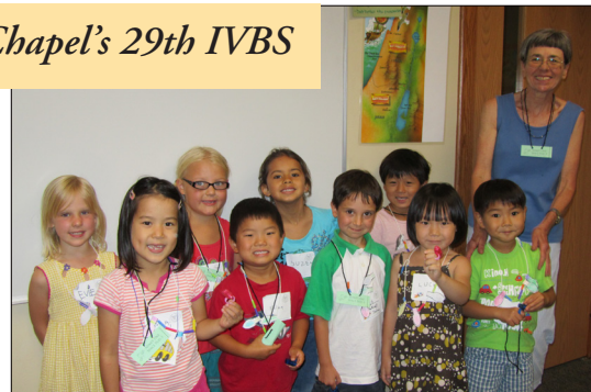
Six nations were represented in the Kindergarten class.

With over 4000 students from over 130 countries at UW-Madison, we have the opportunity to bring Jesus to people from virtually "every nation, tribe, people, and language" (Revelation 7). During the school year Chapel serves more than 150 internationals each week through: International luncheons, Baking and Bible classes, Sunday School, English as a Second Language (ESL) classes, ESL Bible Classes and Saturdays for Kids.