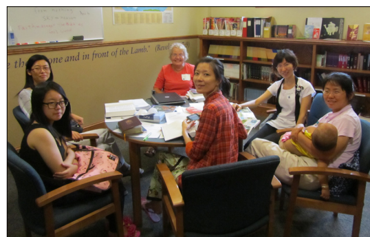
Classes for adults were also available at IVBS.